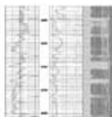
9-5/8 inch Casing in Vertical Wellbore